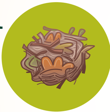
Tinder – small twigs, dry leaves or grass, dry needles.