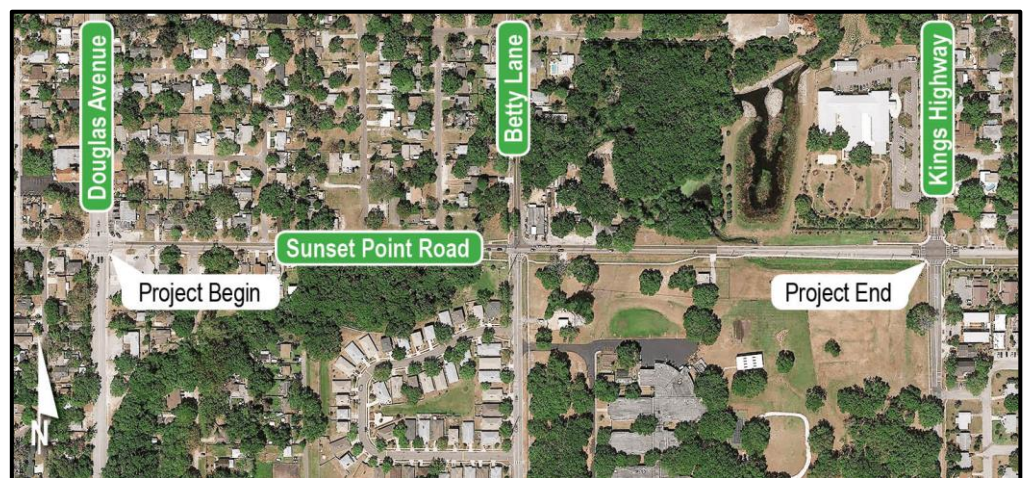
Sunset Point Road (CR 576) Project Area

A Southwest Florida Water Management District (SWFWMD) grant will fund part of the project.